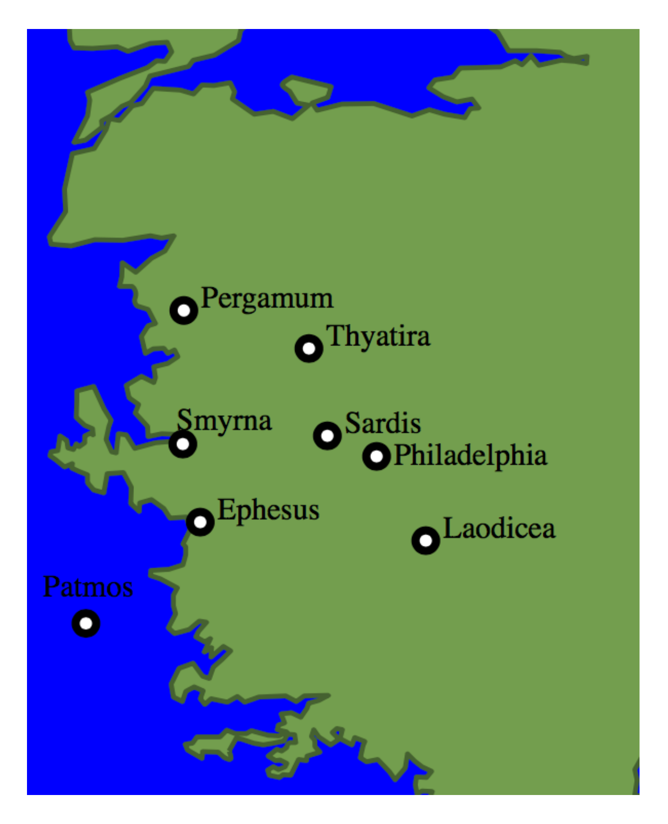
All quotes NKJV except as noted. New King James Version<sup>®</sup> Copyright © 1982 by Thomas Nelson, Inc. Used by permission. All rights reserved.